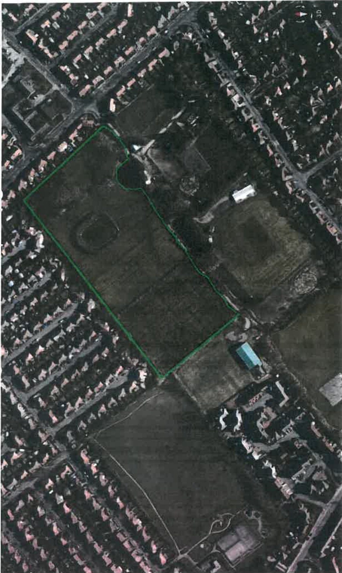
Aerial view of Windsor Park showing grazing fields highlighted with a green surround.